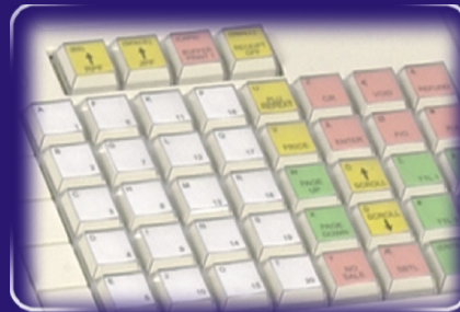
Raised & Flat Keyboard with name tags