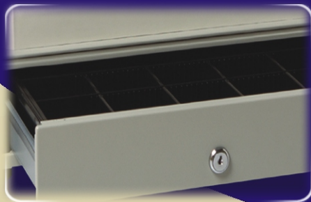
Draws with lock and key