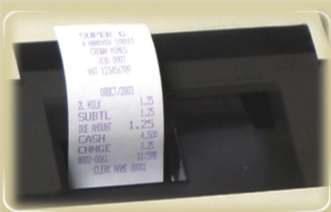
Standard comms board (RS - 485, RS - 232) IRC, PC, KP, Na 720, slip printer